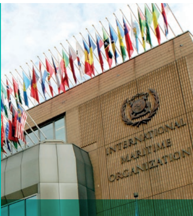
IMO Headquarters, London

Recent developments In recent years the IMO Legal Committee has been conducting focused work to facilitate the entry into force and implementation of the Convention, resulting in the production of educational materials and the proposed adoption of an Assembly Resolution on the matter. In April 2017 an EU Council decision officially cleared the way for EU Member States to become parties to the Convention. Also in 2017, Norway became the first IMO Member State to ratify the 2010 HNS Protocol and it is hoped that momentum will now build to bring this important instrument into force.