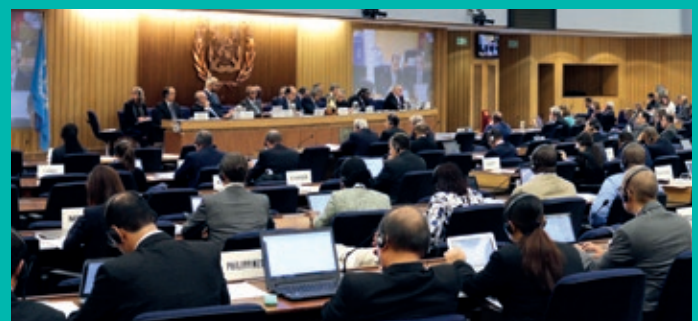
IMO in session in London

CMI is an international association of maritime lawyers, established in Antwerp in 1897, the object of which is to contribute by all appropriate means and activities to the unification of maritime law in all its aspects. To this end CMI collaborates closely with IMO on matters of mutual interest. CMI's membership consists of national maritime law associations that work closely with ICS member national shipowners' associations.