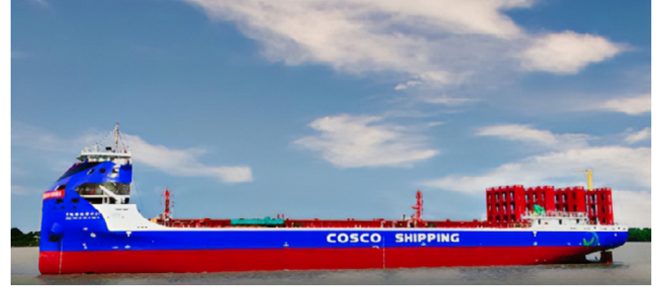
Chinese carrier Cosco launched a 700 teu battery powered containership that will operate on the Yangtze River.

In a <u>recent note</u>, power industry consultancy PTR observed that "China has